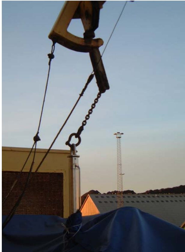
The new MOB-boat hooked on