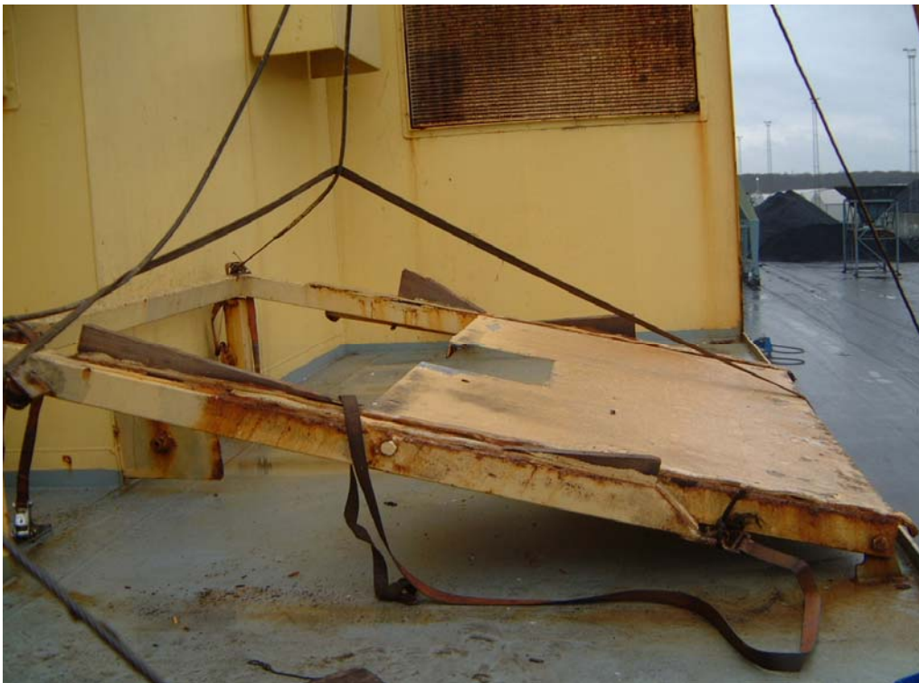
The cradle folded