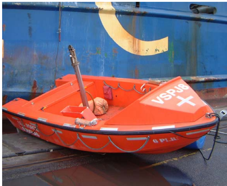
The MOB-boat on the quay after the accident