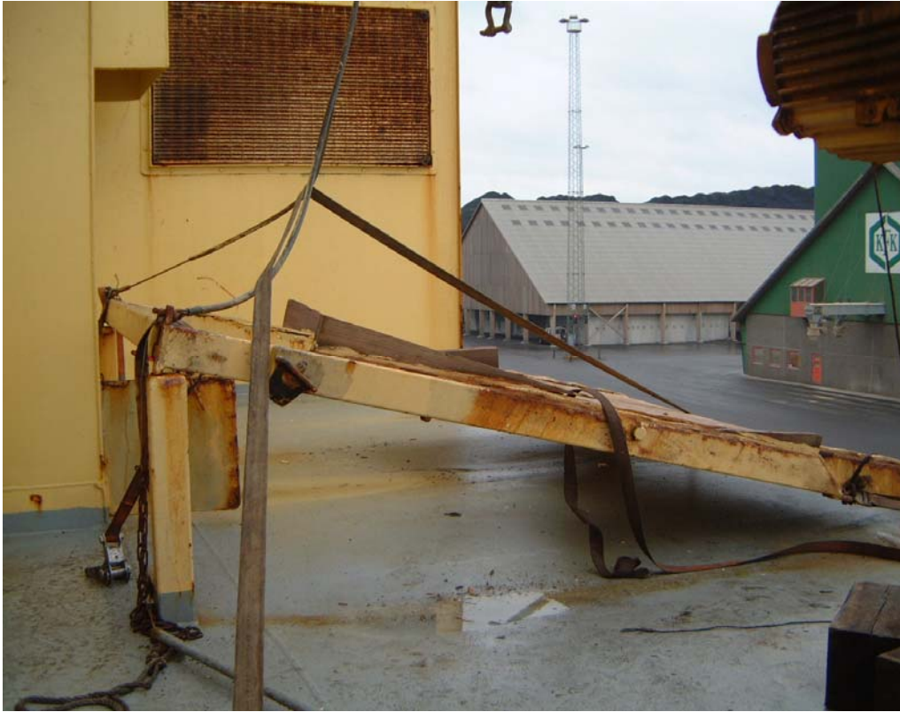
The cradle folded