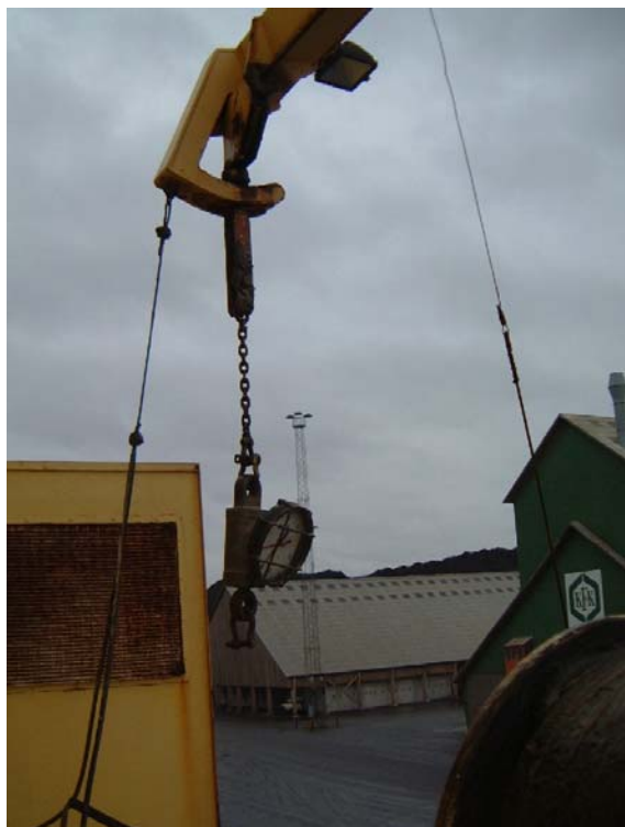
The dynamometer mounted to the chain below the iron bob