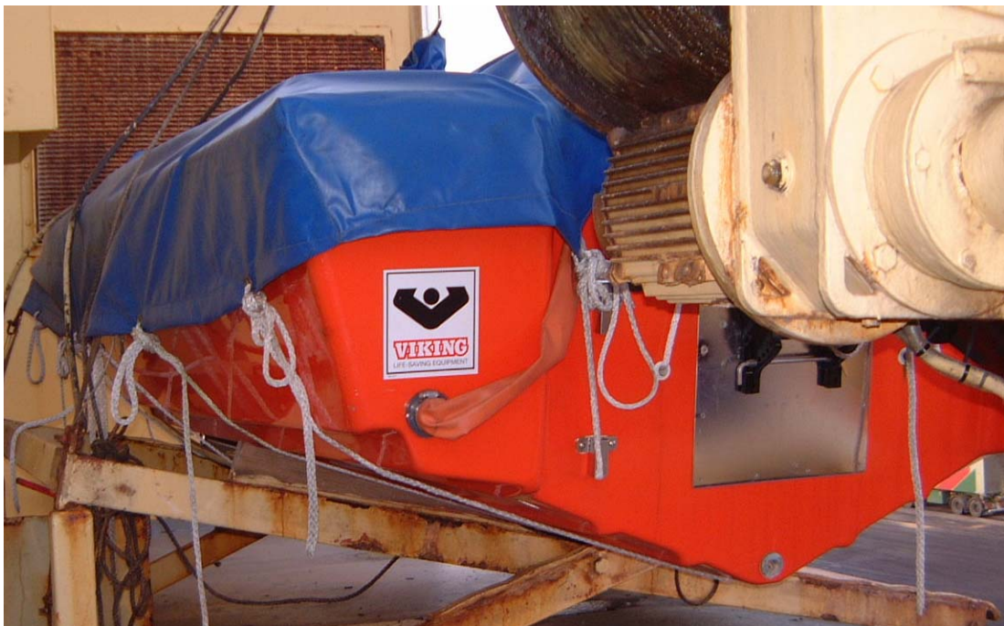
The new MOB-boat in its cradle